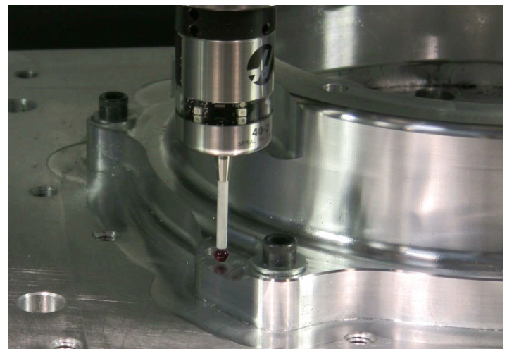
Mastercam Productivity+ can be used with 3-axis mills (vertical and horizontal) and multiaxis (3+2) mills.